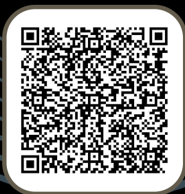
QR Code for UPI

Kindly scan the QR code for UPI or use the info below for the payment of registration fee.